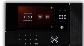
SYNERGY 5 FACE