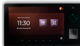
SYNERGY 10 FINGERPRINT