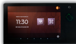
SYNERGY 10 READER