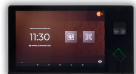
SYNERGY 10 FACE