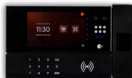
SYNERGY 5 DUAL