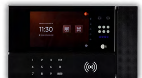
SYNERGY 5 FACE