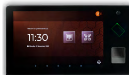
SYNERGY 10 FINGERPRINT