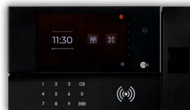
SYNERGY 5 FINGERPRINT