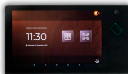
SYNERGY 10 READER