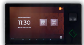
SYNERGY 10 FACE