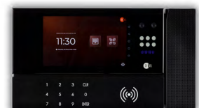
SYNERGY 5 FACE