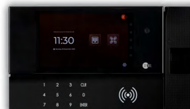
SYNERGY 5 FINGERPRINT