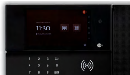
SYNERGY 5 READER