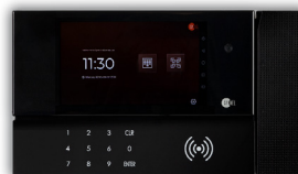
SYNERGY 5 READER