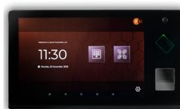
SYNERGY 10 FINGERPRINT