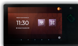
SYNERGY 10 READER