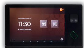
SYNERGY 10 FACE