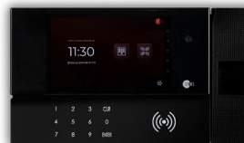
SYNERGY 5 FINGERPRINT