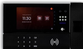
SYNERGY 5 DUAL