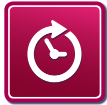
Time & Attendance Management